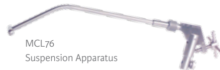
MCL76 Suspension Apparatus